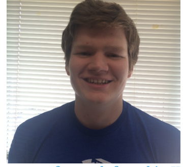
One aspect of growth found in IB?

I am a captain of both the Minnetonka HS Alpine Ski team and a club ski team, and I also particate in a rugby club. To manage my time, I prioritize my work and evaluate how long work will take me so I don't get surprised by a huge project the day before it is due.